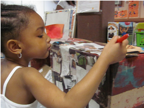
Painting her interpretation of a cardboard Learning Center

Our children are just as excited as we are about the new Learning Center, so our teachers have led the young students through a construction-related curriculum filled with creative, hands-on, stimulating projects that engage them in the construction of the new building.